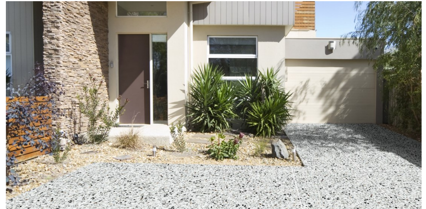
Grés Porcelain floor & wall Tiles