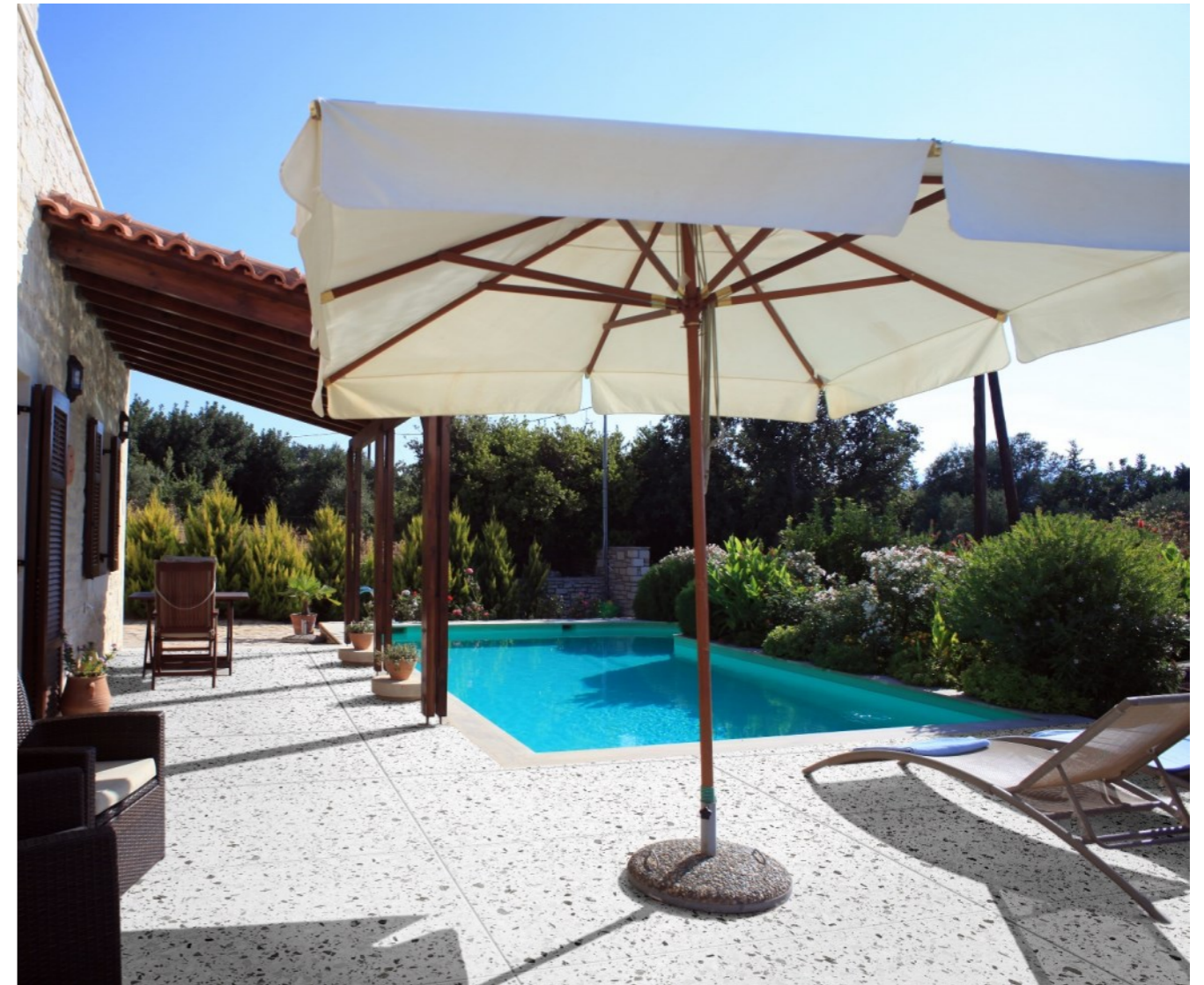
Grés Porcelain floor & wall Tiles