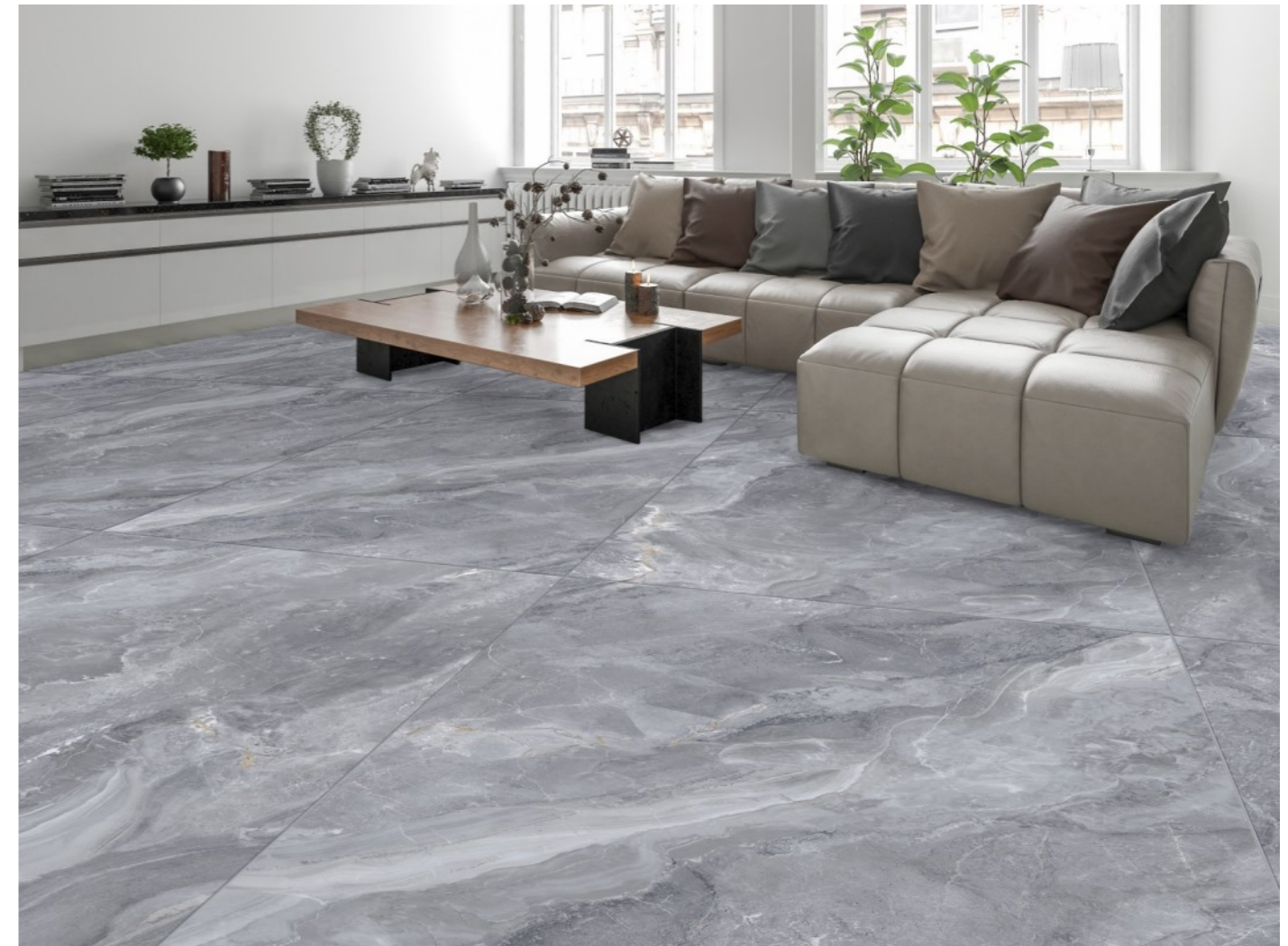
Grés Porcelain floor & wall Tiles